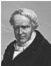
Alexander von Humboldt

Alexander von Humboldt, Alfred Wallace and Charles Darwin, (the bearded botanists) who individually provided us with most of the maths needed to design adaptive telecommunications systems. Prior art almost always exists. Unfortunately, or fortunately for patent attorneys it is often not well recorded.